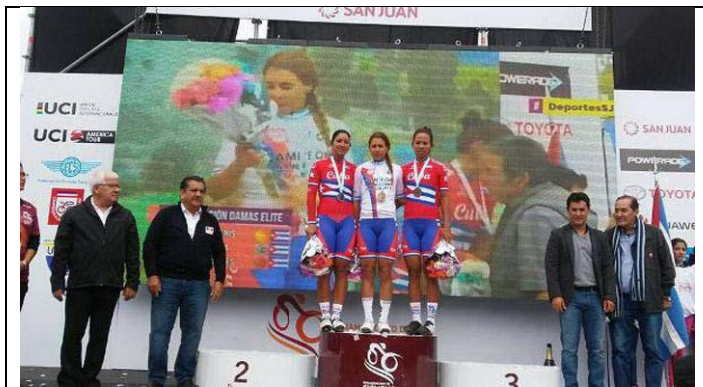
Arlenis Sierra won gold in the 2018 Pan American Road Cycling Championships.

Author: Redacción Digital | internet@granma.cu - may 7, 2018 10:05:53