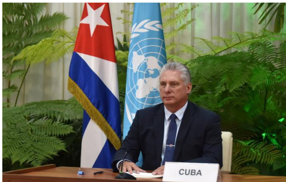
Miguel Díaz-Canel Bermúdez

"Doctors, not bombs," was once demanded by the historical leader of the Cuban Revolution and chief promoter of scientific development in Cuba: Commander-in-Chief Fidel Castro Ruz. This is our maxim. Saving lives and sharing what we are and have, no matter the sacrifice; this is what we are offering to the world from the United Nations, of which we only request change as required by the gravity of the moment.